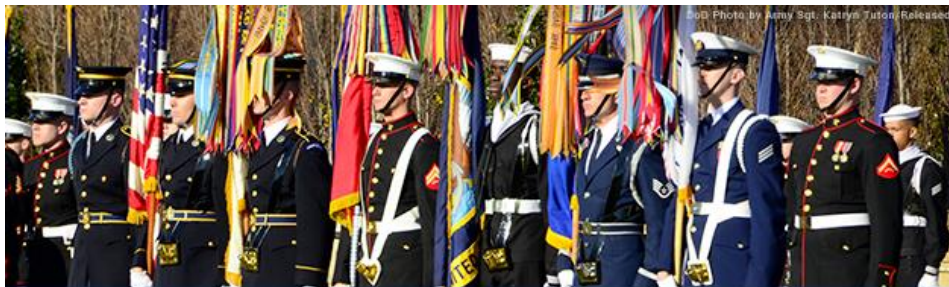
VETERANS DAY | NOVEMBER 11